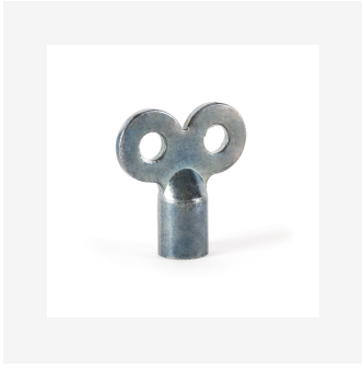
Air Vent Key (Spare)