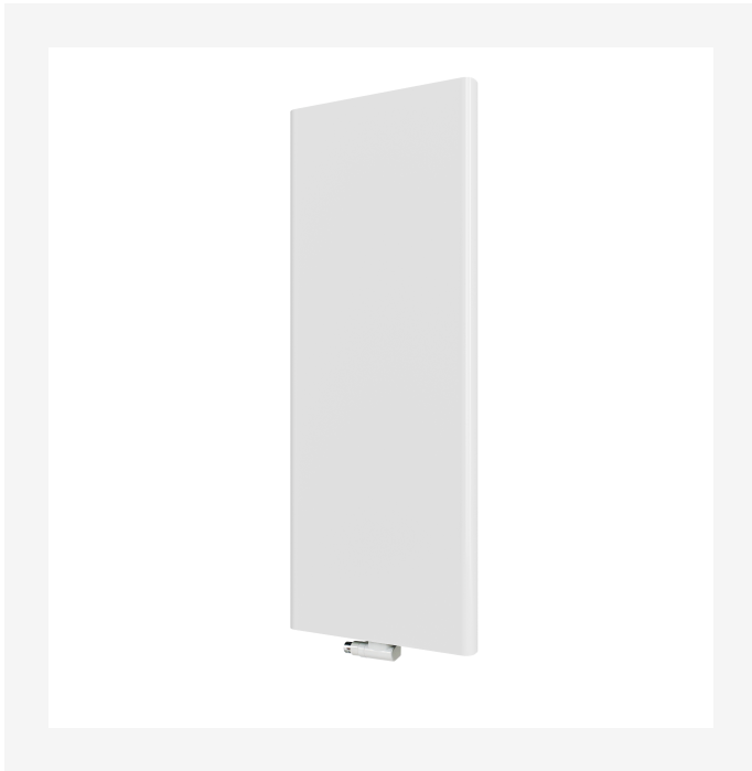
ProductImage - New_Paros-V main picture