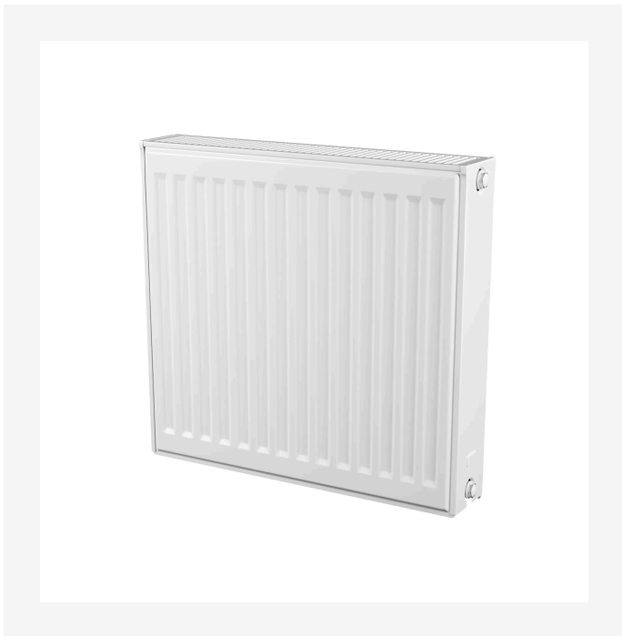
ProductImage - Product Picture