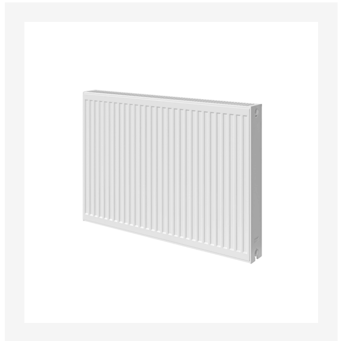
ProductImage - Select Compact