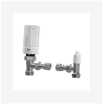
TRV2 Radiator Packs