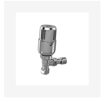
Decorative TRV Valves