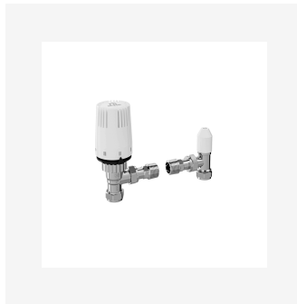
Myson Plus Radiator Packs