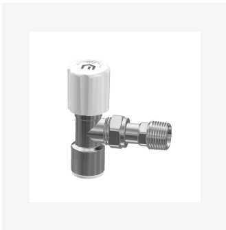
Myson Plus Manual Valves