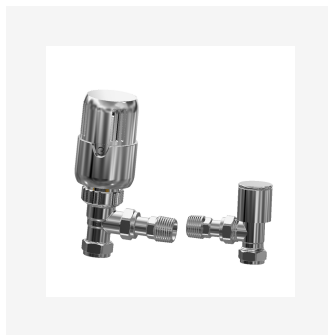
Decorative TRV Valve Pack