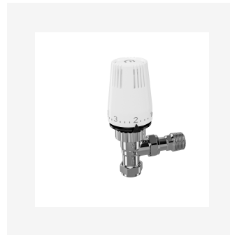
Myson Plus TRV Valves