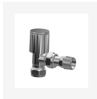
Decorative Slimline Valves