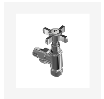
Decorative Traditional Valves