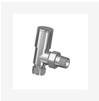
Decorative Modern Valves