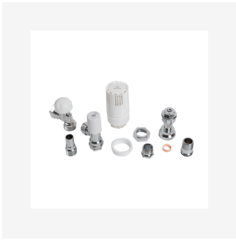
LST TRV Kits