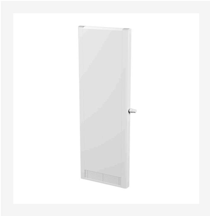
ProductImage - LST-Vertical